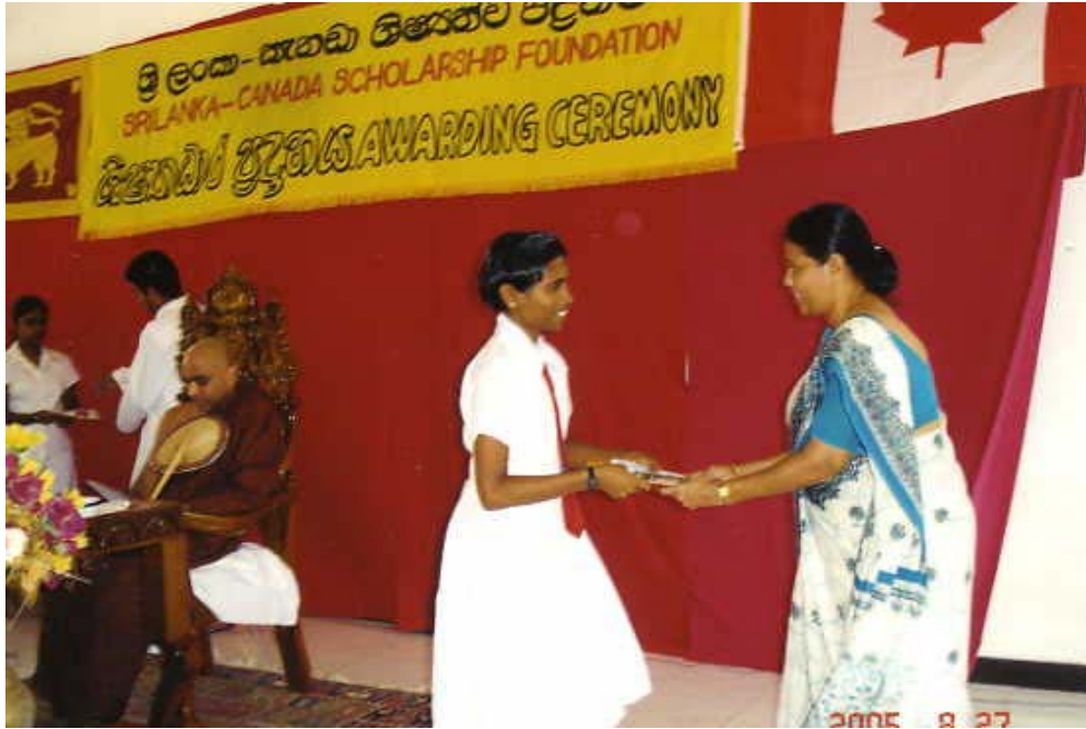
A student receiving her award certificate from the relative of a sponsor.